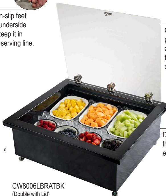
CW8006LBRATBK (Double with Lid)

Clear acrylic lid provides protection and promotes sanitary food safety before, during and after service.