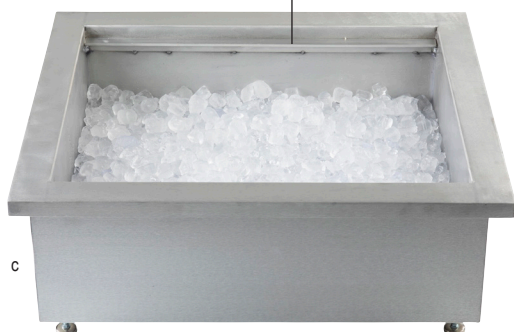
CW8006BRATCL (Double without Lid)