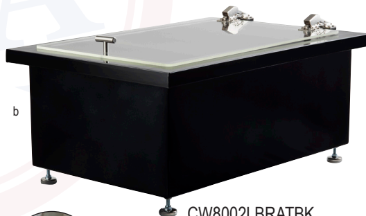
CW8002LBRATBK (Single with Lid)