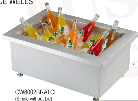
CW8002BRATCL (Single without Lid)